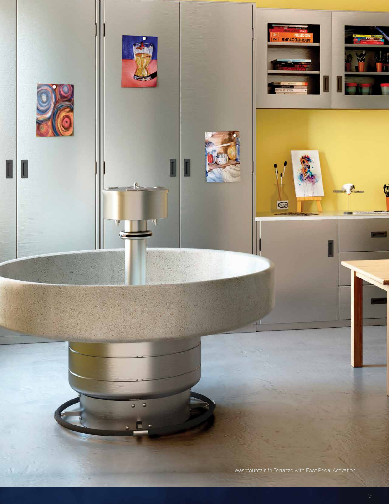
Washfountain in Terrazzo with Foot Pedal Activation.