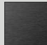
Brushed Black Stainless