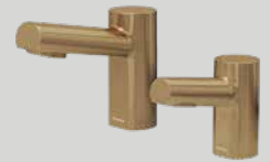
METRO Universal cylindrical design