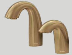
CRESTT Refined high arc design

Impressive line-up of four touch-free styles and six finishes for an industry-leading twenty-four options to choose from.