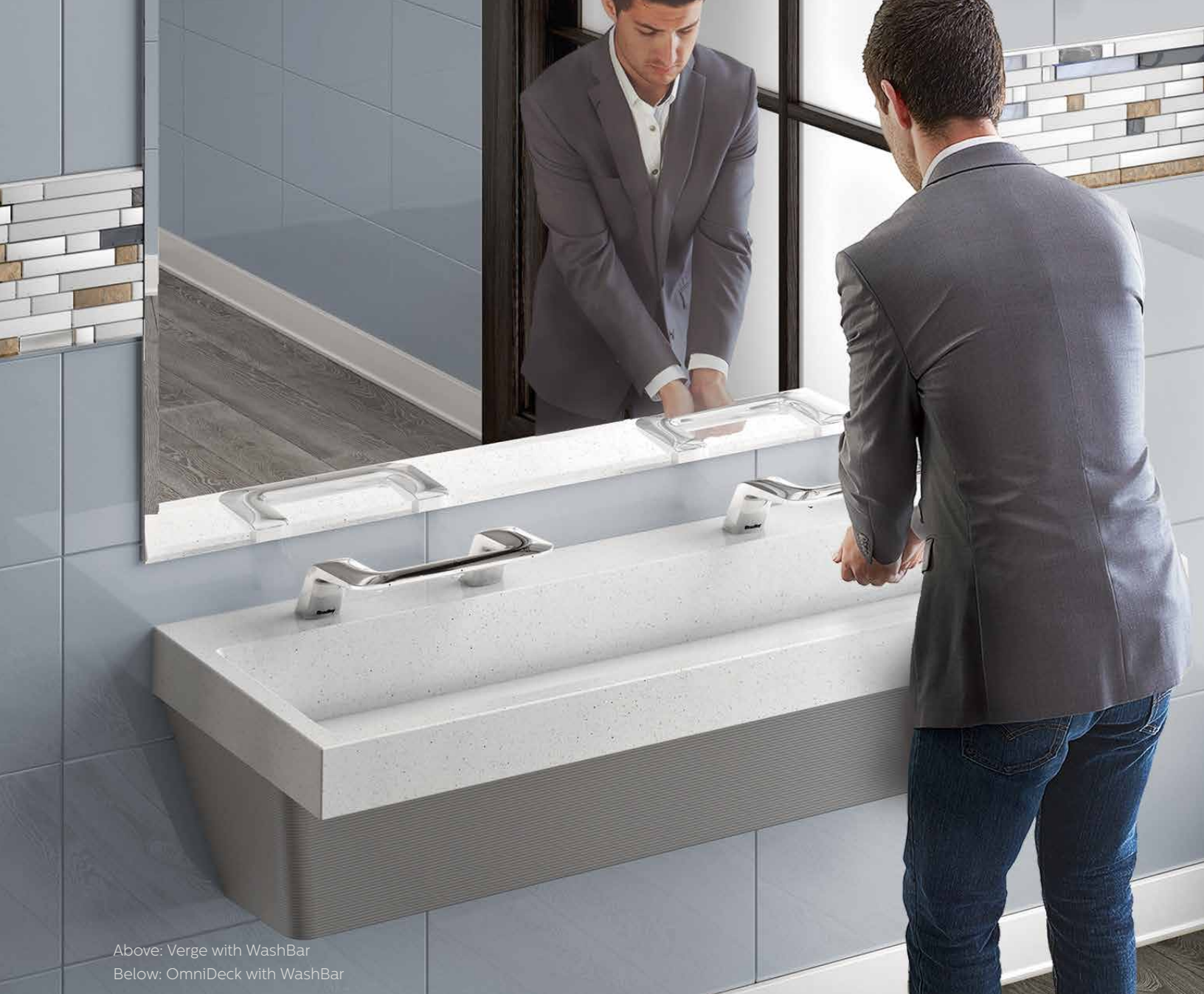
Above: Verge with WashBar Below: OmniDeck with WashBar