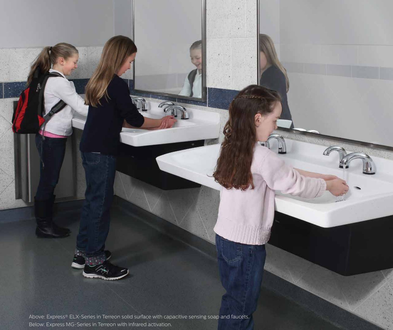
Above: Express® ELX-Series in Terreon solid surface with capacitive sensing soap and faucets. Below: Express MG-Series in Terreon with infrared activation.