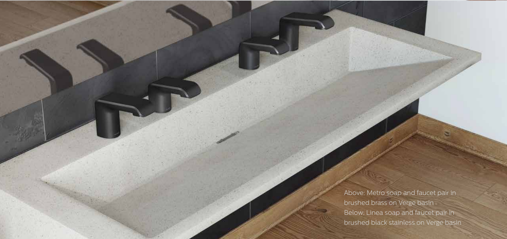
Above: Metro soap and faucet pair in brushed brass on Verge basin Below: Linea soap and faucet pair in brushed black stainless on Verge basin